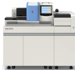
AIA-900 with 9 Tray Sorter (Also available in 19 tray sorter option)