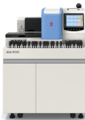
AIA-900 Loader Model